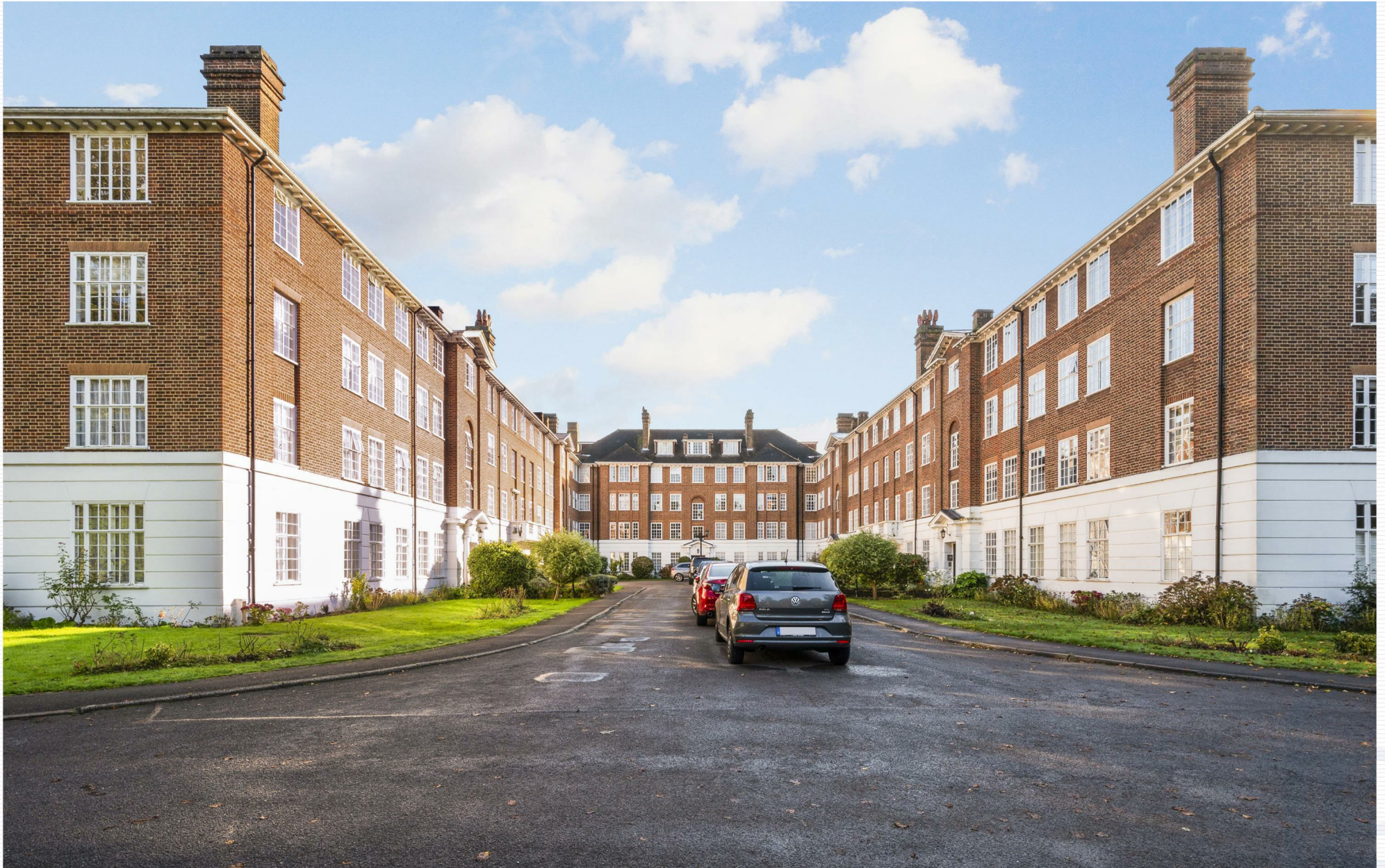
Wimbledon Park Side, Wimbledon, SW19 5NP